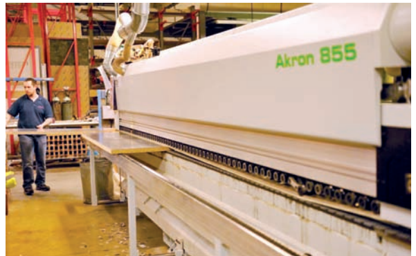
Below: Jowat's Jowatherm Reaktant 607.40 granulated, moisture-reactive hotmelt is available in various quantities from 310 ml cartridges to 200 litres, giving large or small companies the opportunity to benefit from their high performance PUR adhesive technology on whatever equipment it has currently. Co Tops has a Biesse Akron edgebander.